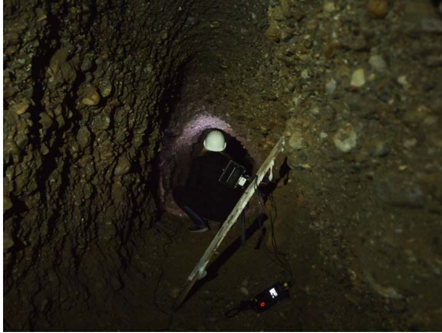
Figure 4 – Two Hydrophones were placed in Ravne Hypogeum in Visoko (Bosnia-Herzegovina) for recording resonance in the ancient structure. There was almost 8-10cm of water on the bottom of the floor, so the Hydrophones were the most adapt device for recording vibrations in these conditions (Debertolis and Savolainen 2012).

For recording ultrasounds we use a Pettersson D1000X Bat detector and Bat sound software, Pettersson Elektronik, Uppsala University. It is the best source for recording ultrasounds from every source. Originally built for recording ultrasounds from bats, this device is very useful for recording natural ultrasounds up to 400.000Hz (Figure 5).