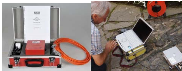
Figure 7 – Left: GeoBox SR04S3. Right: the device connected with the computer at work.

We also use a geologic device for confirming what we find by microphones in infrasound range. It is GeoBox SR04S3 Datasheet from Italian firm SARA. The digital sensor SR04 GeoBox is a high-performance instrument especially suitable for acquiring signals for seismological and geophysical surveys such as the Horizontal/Vertical Spectral Ratio - HVSR. The SR04 GeoBox is designed especially for recording ambient seismic noise, but it can also record earthquakes and artificial vibrations. Compact, reliable and simple, it is fully functional within minutes after deployment (Figure 7).