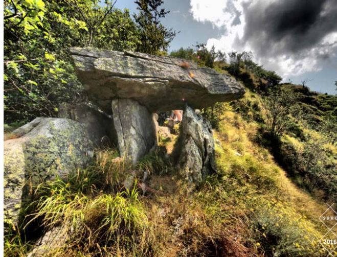
Figure 1 – A typical Neolithic sacred site placed on Apuan Alps in Italy. Our research showed strong infrasounds just in this location able to affect mind. These frequencies are not present also at short distance. These vibrations have a geologic origin, probably because of the frictions of geological faults close to this site.