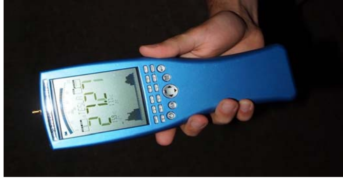
Figure 6 - Spectran NF-3010 from the German factory Aaronia AG.

We also use a geologic device for confirming what we find by microphones in infrasound range. It is GeoBox SR04S3 Datasheet from Italian firm SARA. The digital sensor SR04 GeoBox is a high-performance instrument especially suitable for acquiring signals for seismological and geophysical surveys such as the Horizontal/Vertical Spectral Ratio - HVSR. The SR04 GeoBox is designed especially for recording ambient seismic noise, but it can also record earthquakes and artificial vibrations. Compact, reliable and simple, it is fully functional within minutes after deployment (Figure 7).