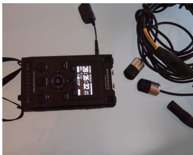
Figure 3 – The Aquarian H2a-XLR Hydrophones together with the digital recorder Marantz PMD661.

For recording in water we used ultrasensitive omnidirectional microphones also used by sea biologists (Aquarian H2a-XLR Hydrophone, frequency response from 10Hz to 100Hz) with shielded water proof cable from factory (Figure 3). This type of microphone has a wide bandwidth typically used to hear whale song up to several kilometers away. In this case the sound is transmitted very quickly in water, with the body of water acting as a reflector capable of capturing every vibration many meters away (Figure 4).