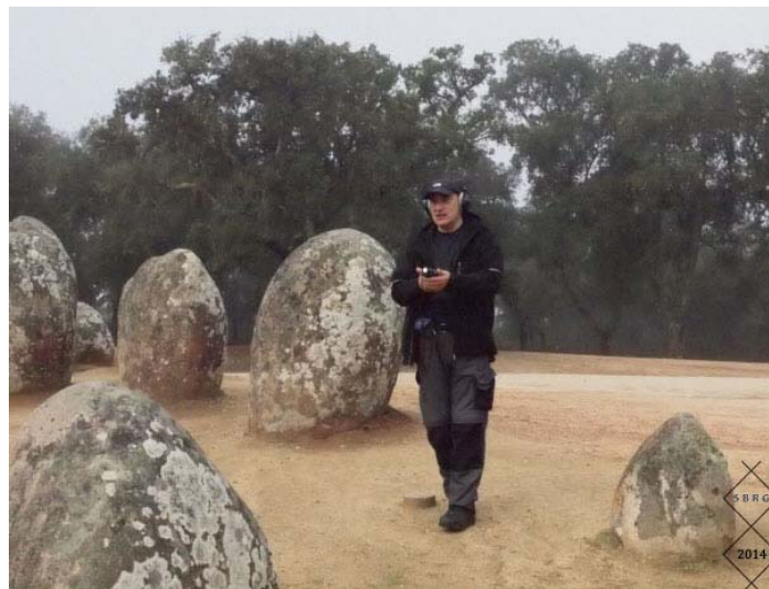
Figure 5 – We used the Pettersson D1000X Bat detector from Swedish firm Pettersson Elektronik a lot in Portugal during our research on stone circles. The study showed that the granite megaliths are able to produce some interesting ultrasounds if hit by the sun. These infrasounds are closely placed audible frequencies and perceptible by a sensitive ear.

For recording ultrasounds we use a Pettersson D1000X Bat detector and Bat sound software, Pettersson Elektronik, Uppsala University. It is the best source for recording ultrasounds from every source. Originally built for recording ultrasounds from bats, this device is very useful for recording natural ultrasounds up to 400.000Hz (Figure 5).