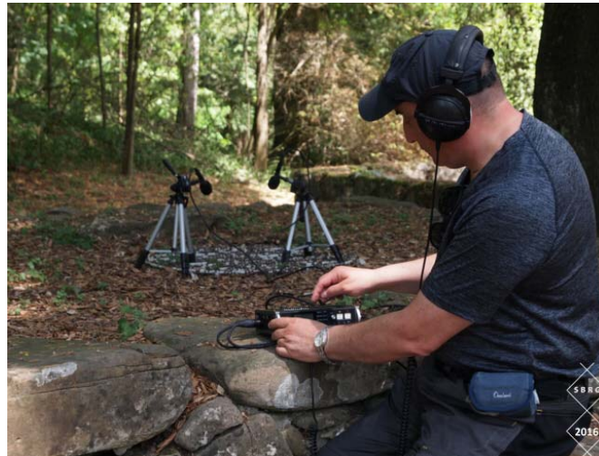
Figure 2 – The set-up used for recording sounds: the recorder Tascam DR-680 and Sennheiser MKH 8020 microphones placed in the sacred Etruscan acropolis at Marzabotto (Italy).

sampling rate of 192KHz (Tascam DR-680 of TEAC Group), but we controlled the result with other digital recorders (Tascam DR-100 and Marantz PMD661) with less technical characteristics. At the same time as recording in the air we used professional studio microphones with a wide dynamic range and a flat response at different frequencies (Sennheiser MKH 8020, response Frequency 10Hz - 60.000Hz) along with shielded cables (Mogami Gold Edition XLR) and gold-plated connectors (Figure 2).